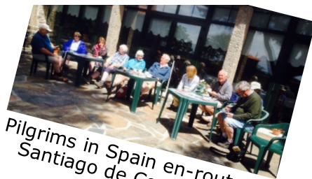
Pilgrims in Spain en-route to Santiago de Compostella