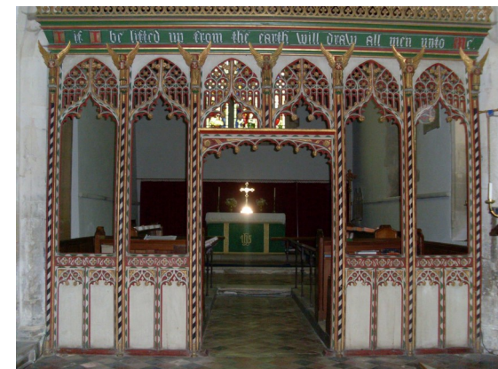
The Chancel Screen in Lt. Gransden

The maintenance of our ancient building is always at the forefront of our minds and PCC meetings. Once the work above is completed we shall have depleted our Restoration Fund and we shall need to move onto the next work that is required to keep our building standing. Any improvements such as toilet, kitchen, water, comfortable chairs, reliable sound system, decorating etc. are all a pipedream.