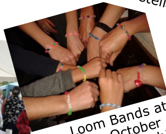
Loom Bands at the October All Age Worship