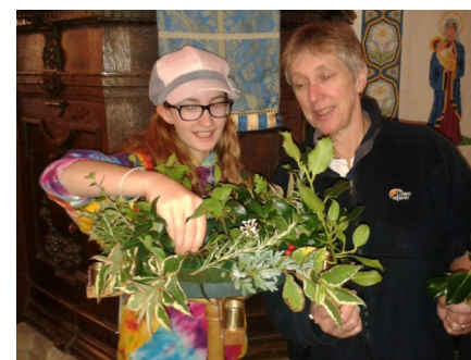
Preparing the Advent wreath in Gt. Gransden

We pray to be generous and visible people of Jesus Christ in our parishes and in our lives outside them.