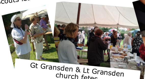
Gt Gransden & Lt Gransden church fetes