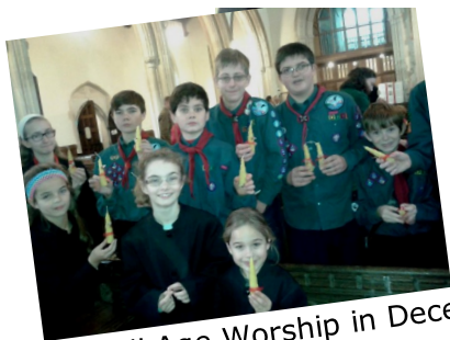
Scouts lead All Age Worship in December